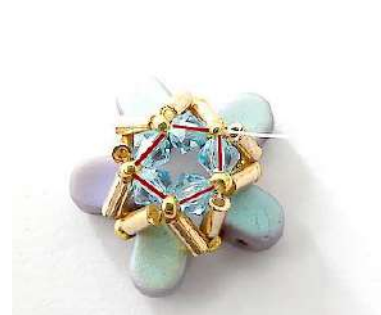
6) Here the result 😊 Reinforce