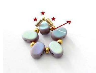
3) Insert 1 B, 1 SB15 and 1 B between each SB11