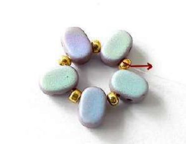
2) Close and exit HERE through the SB11