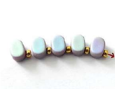
1) Alternate 5 Lipsi and 5 SB11 on the thread