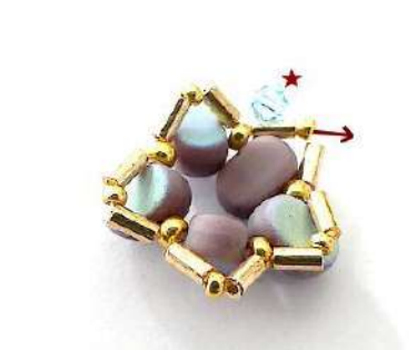
5) Between each SB15 insert 1 B3