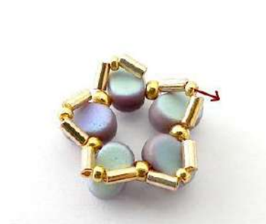
4) Here the result 😊 Exit through the SB15 HERE